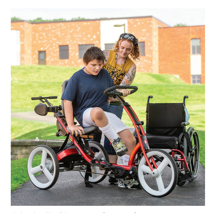
The laterals and handlebar swing away for easy transfers.