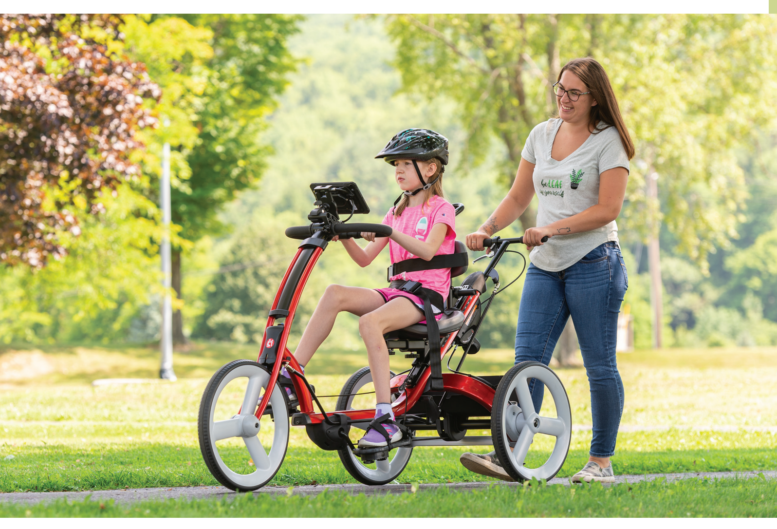
Riders feel more independent when a caregiver assists from behind with the rear steer.