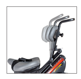
Backrest angle Position the backrest vertically or at a 7½° or 15° recline.