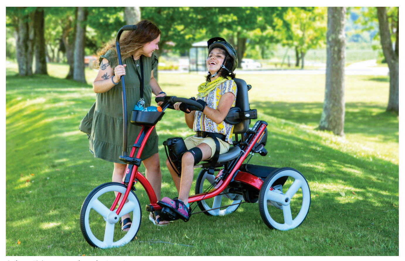
The front guide bar encourages face-to-face interaction.