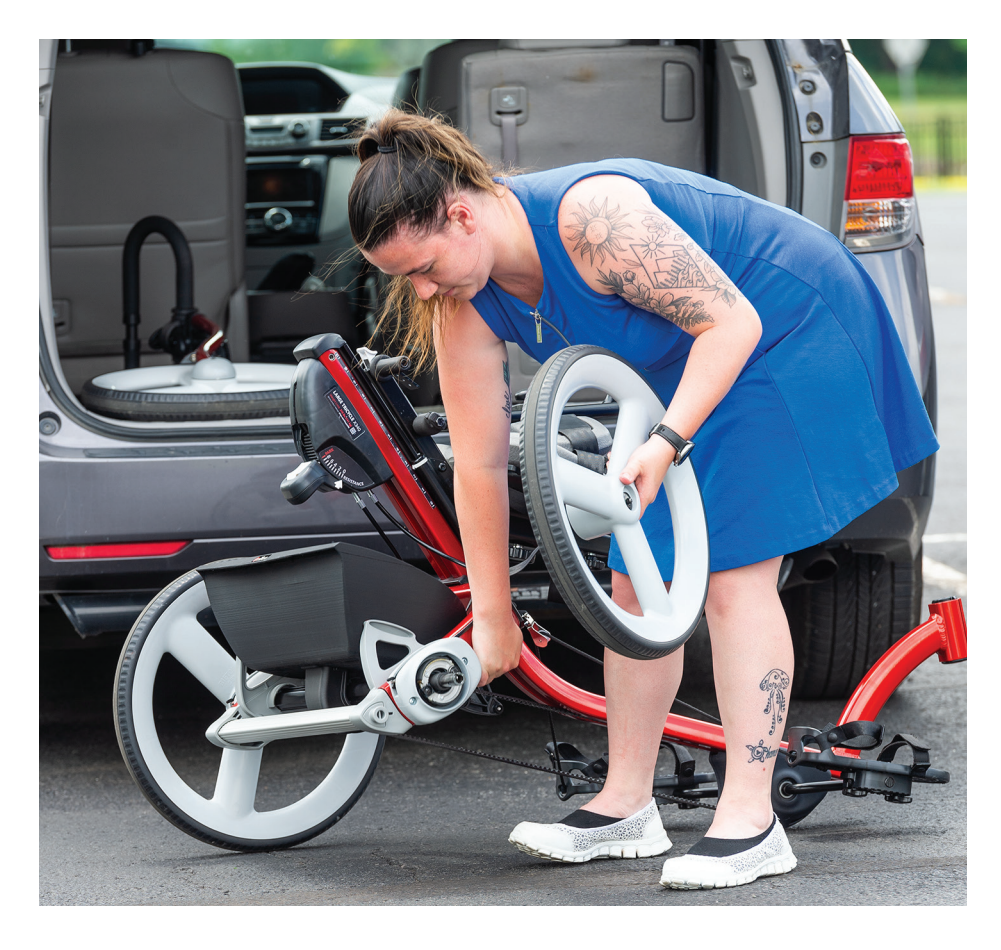
Remove rear wheels and front end, and flip down the backrest for easy transport.