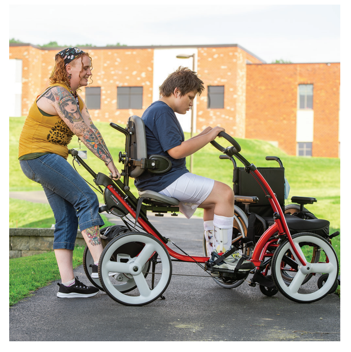
The seat glides up and down on a low-friction rail. This rider pushes with his feet to help his caregiver raise the seat.