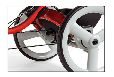
Carbon fiber drive belt The drive belt will not rust or stretch, and will last at least five times longer than a bicycle chain.